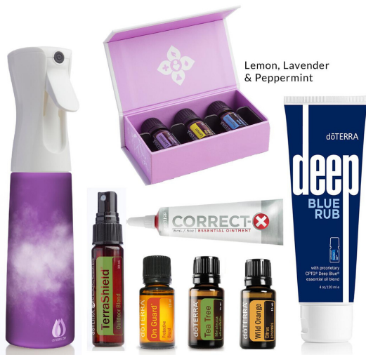
Lemon, Lavender & Peppermint

Apply Deep Blue Rub before and after strenuous work to support sore joint and muscles.